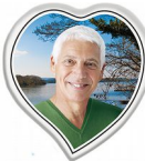
Left Tear Heart