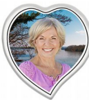
Right Tear Heart